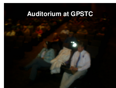
Auditorium at GPSTC